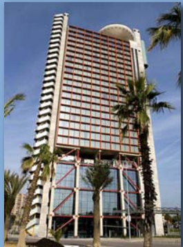
Congress Venue Hotel Hesperia Tower

S.E.L.O Technical Secretariat MdV-Organización y Protocolo Bruc, 28, 2º · 08010 Barcelona Tel. +34 607 499 365 secretaria@selo.org.es